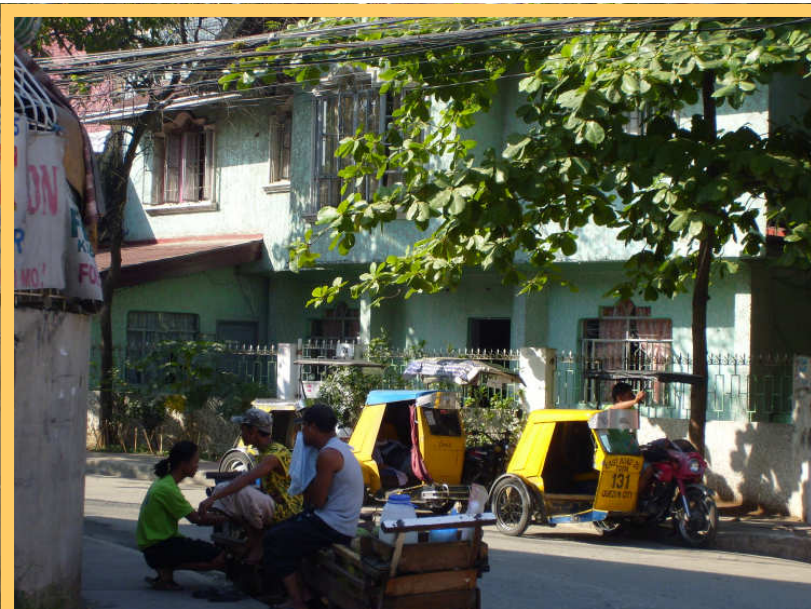
Old Mango, happy family home for many years.

We have many happy memories of the home we built and occupied for 13 years and wish the new owners every good wish for the future.