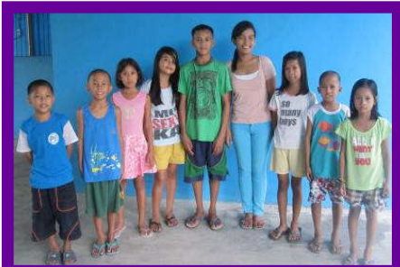
The new intake of Mango children