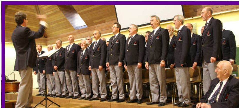
The Rushmoor Oddfellows male voice choir concert raised over £1100