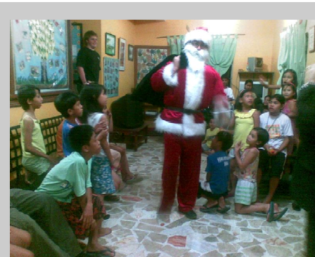
FATHER CHRISTMAS VISITS

As with all families, Christmas is a busy time for ASCT. There are parties to organise, presents to buy and food to prepare. Many of our Mango children visit their families over Christmas and so bags have to be packed and travel arrangements made. Despite this hectic schedule the children had a fantastic time over Christmas with one of the highlights being a visit from Father Christmas. Thank you to all our sponsors for helping to make Christmas a special time.