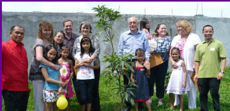
Members of the ASCT and ASCF boards celebrate the grand opening of Mango Tree House with the planting of a mango tree in the grounds.