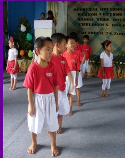
Cashew School children perform their dance.