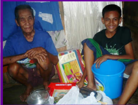
Happy faces with new kitchen equipment.

Thank you to everyone who took part in our alternative Christmas scheme. This year we raised a fantastic £1683. The items bought were given to the children and families from all of our three projects.