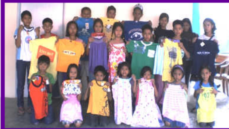
Grapevine children with new clothes.

Thank you to everyone who took part in our alternative Christmas scheme. This year we raised a fantastic £1683. The items bought were given to the children and families from all of our three projects.