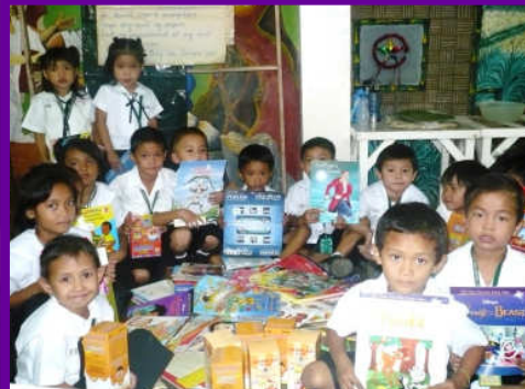
Books and vitamins for Cashew children.