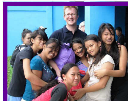
BRITISH AMBASSADOR WITH SENIOR MANGO GIRLS

As things return to normal we are just thankful that we, as a small charity, could help so many people. A huge debt of gratitude is due to everyone who gave up hours of their time in horrendous conditions to help the local people in their hour of desperate need. Thank you to them all.